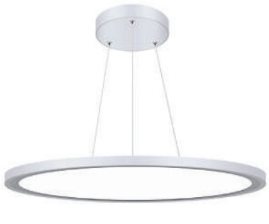
Dieses Produkt enhält eine Lichtquelle der Energieeffizienzklasse <F>.